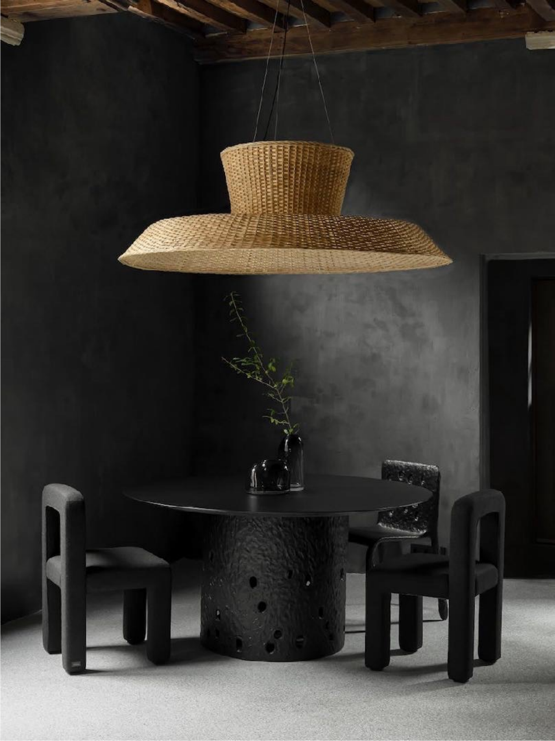
FAINA Gallery, Antwerp